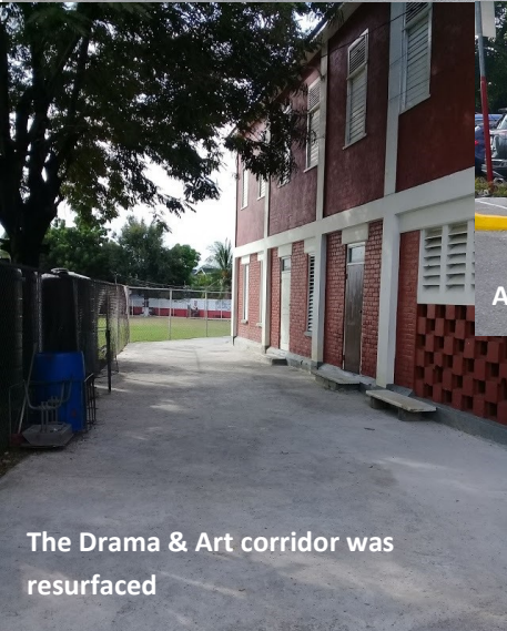
The Drama & Art corridor was resurfaced