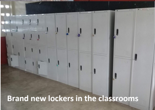
Brand new lockers in the classrooms