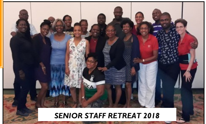
SENIOR STAFF RETREAT 2018