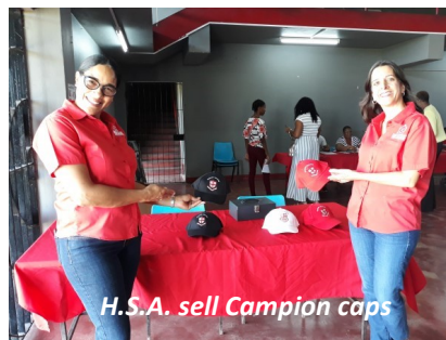
H.S.A. sell Campion caps