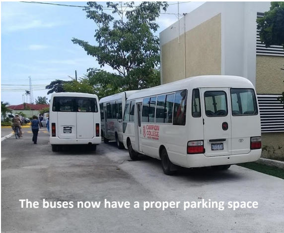
The buses now have a proper parking space