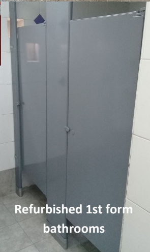
Refurbished 1st form bathrooms