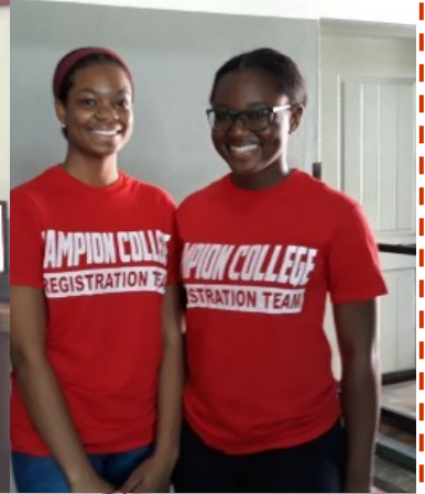
REGISTRATION ACTION & HELPING OUT AT THE 6A VALEDICTORY EVENT