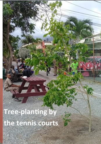
Tree-planting by the tennis courts