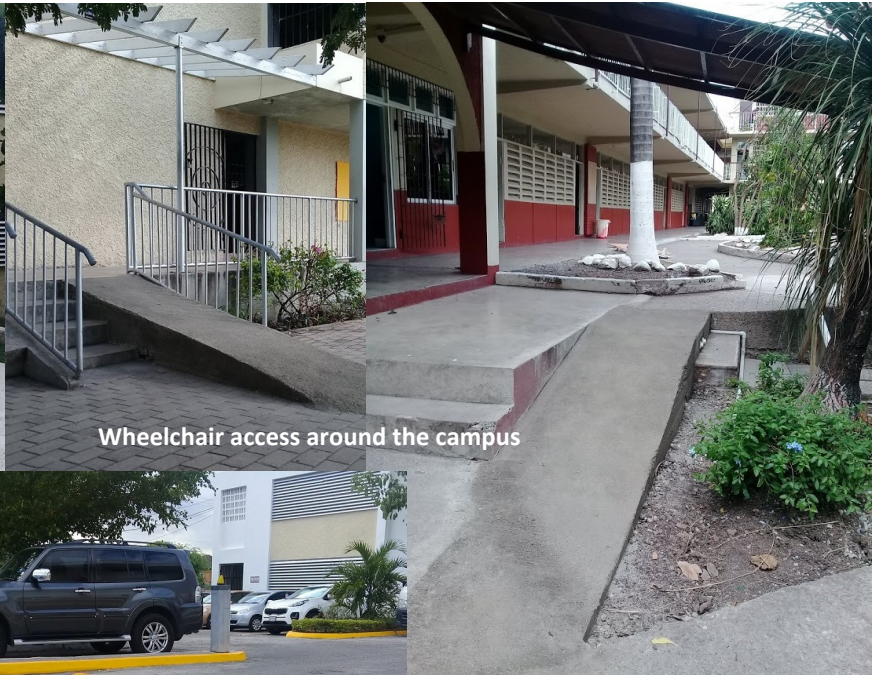
Wheelchair access around the campus