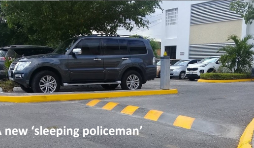
A new 'sleeping policeman'