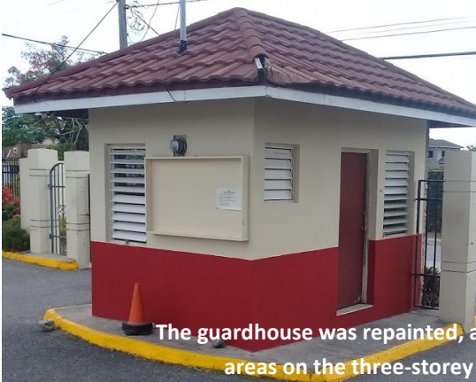
The guardhouse was repainted, also the 6th form building, Supervisors' offices, areas on the three-storey building, Staff House & the Main Office