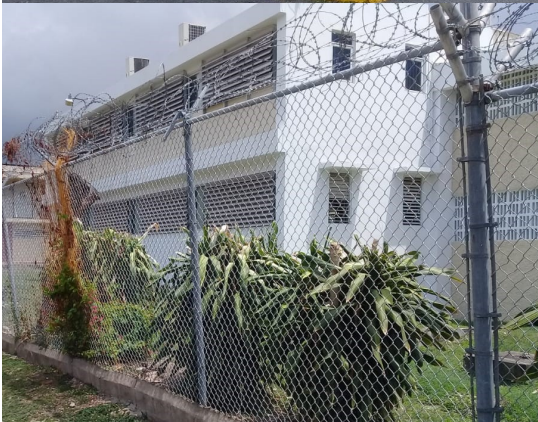
80' of perimeter fencing on Hopefield Ave repaired, thanks to the kindness of Fence Masters Ltd.