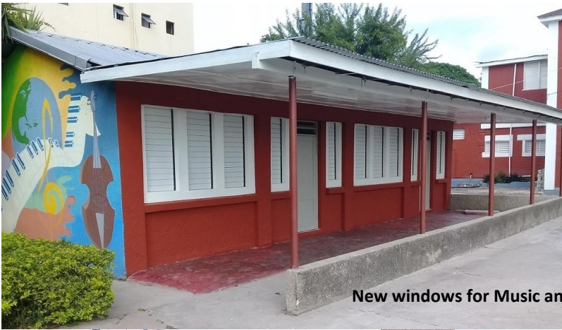
New windows for Music and Drama